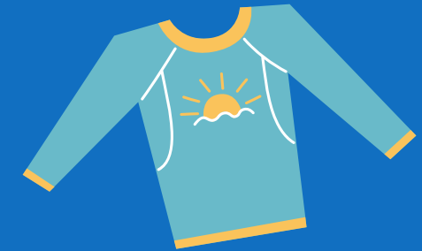
Sun Safe Clothing