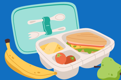
Morning Tea & Lunch